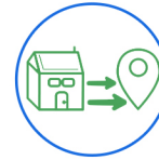
Off Premise Losses