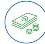
Loss of Rental Income