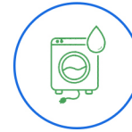
Overflow of Appliances