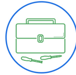
Wear and Tear