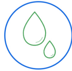
Water Backup of Sewer, Drain or Sump