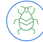
Bed Bug Remediation